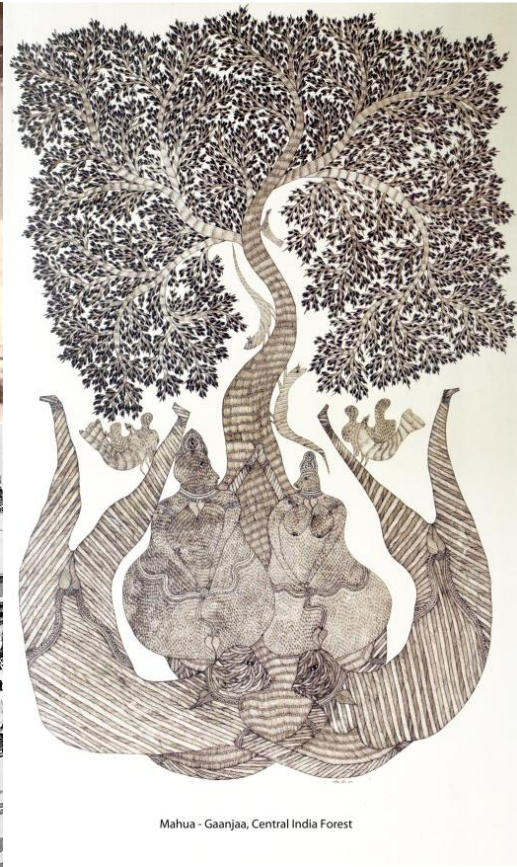
Mahua - Gaanjaa, Central India Forest

This course focuses on the interplay of history, memory and archives to understand and craft parallel histories in colonial India. It offers historical perspectives on the 'small voice of history,' micro-histories, and local and alternative histories against the background of nationalist history. It will discuss questions of periodization, experience, language, narration and identity in 19 th and 20 th century India.